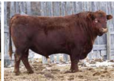
RED GOLDEN SUNSET SQ 80F