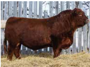
RED DWAJO JES JETHRO 76J