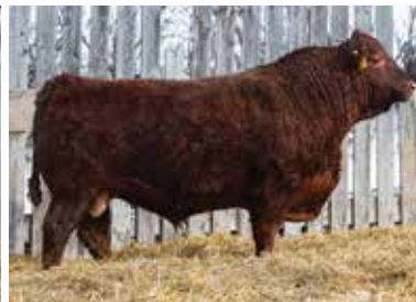
RED FLYING K BOOMER 70H