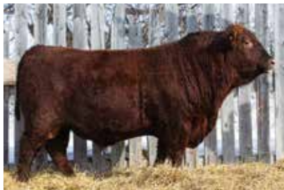
RED REDRICH KIJJI 150K

YCLC 212H was the lead off bull in the Y Coulee sale. We bought a share for $8000 that day and got the buy of the sale. He is very consistent low birthweight and very good growth and muscling.