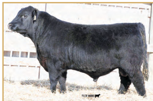
WINDY WILLOWS YOHAN 86E - LOT 24