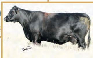
WWF RIGHT TIME BLACKBIRD E 102 DAM OF LOT 27