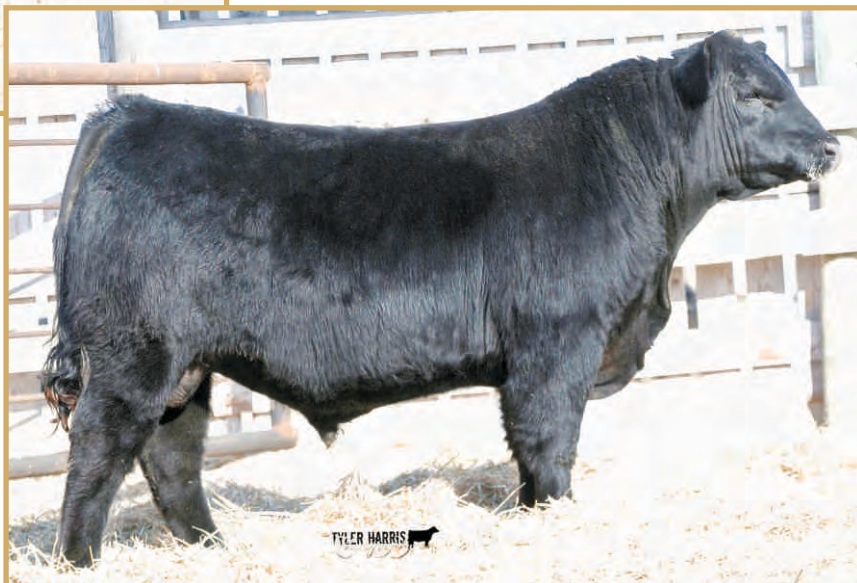
WINDY WILLOWS ZORIAN 1E - LOT 22