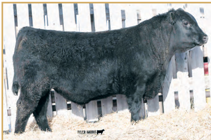
WINDY WILLOWS MERRITT 140E - LOT 31