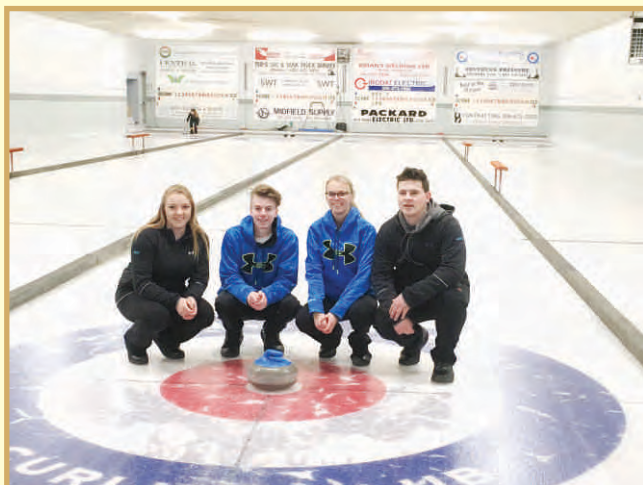
2018 SCHOOL MIXED CURLING TEAM

P.S. - We are committed to providing you with a sound, fertile breeding bull. The mothers of these bulls have sound feet and trouble-free udders. We guarantee it!