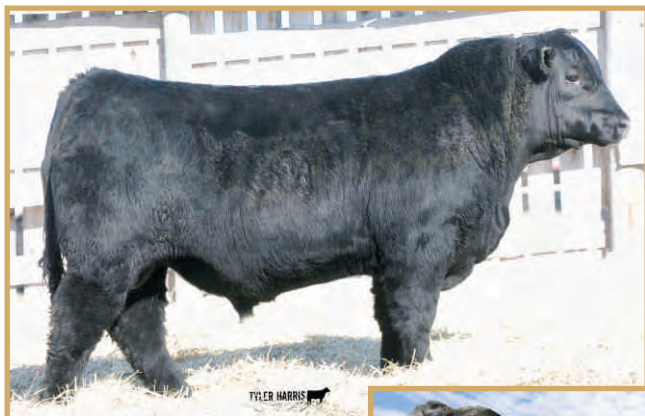
WINDY WILLOWS ZORIAN 4E - LOT 23