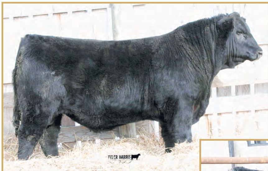
WINDY WILLOWS INTRNTIONAL 180E - LOT 21