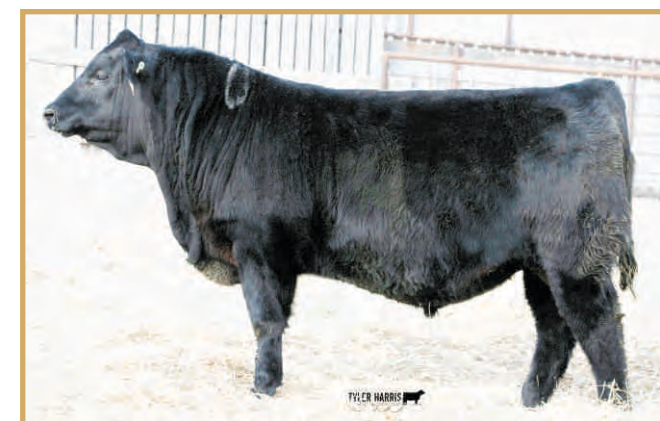
WINDY WILLOWS YOHAN 231E - LOT 25