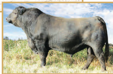
YOUNG DALE ZORIAN 106Z - SIRE OF LOTS 22 & 23