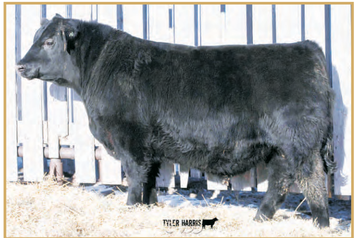
WINDY WILLOWS MERRITT 90E - LOT 29