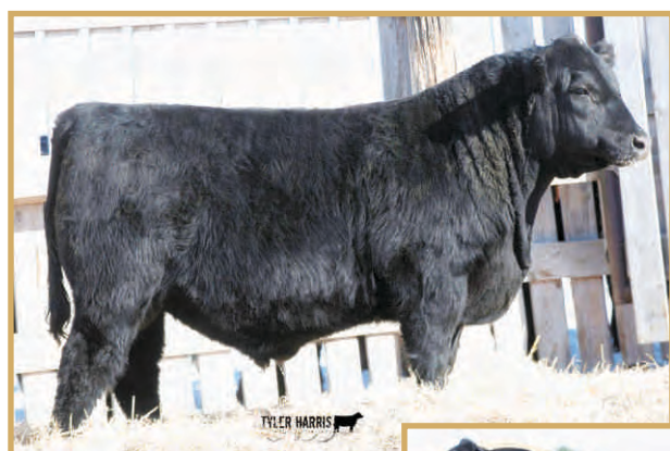
WINDY WILLOWS UNANIMOUS 187E LOT 28

Vision Unanimous is a high performance bull that will improve feet. A maternal sister sold to Northern View Angus through the Frontline Sale.