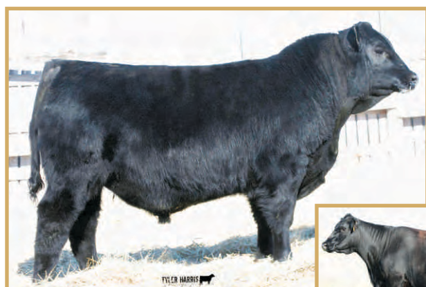
WINDY WILLOWS UNANIMOUS 141E LOT 27