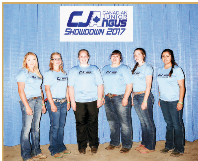
TEAM WINDY WILLOWS SHOWDOWN 2017