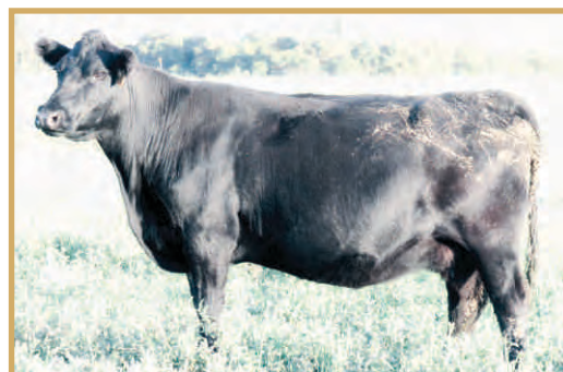
WWF GAME DAY ERICA 20W - DAM OF LOT 21