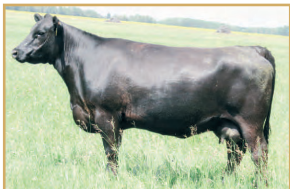
KBJ ELLIE 938A - DAM OF LOT 22