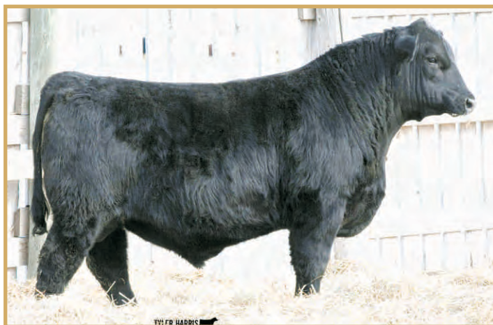
WINDY WILLOWS MERRITT 78E - LOT 30