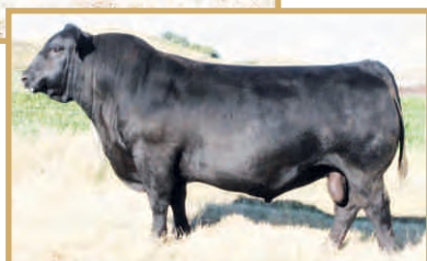
VISION UNANIMOUS 1418 - SIRE LOTS 27 & 28