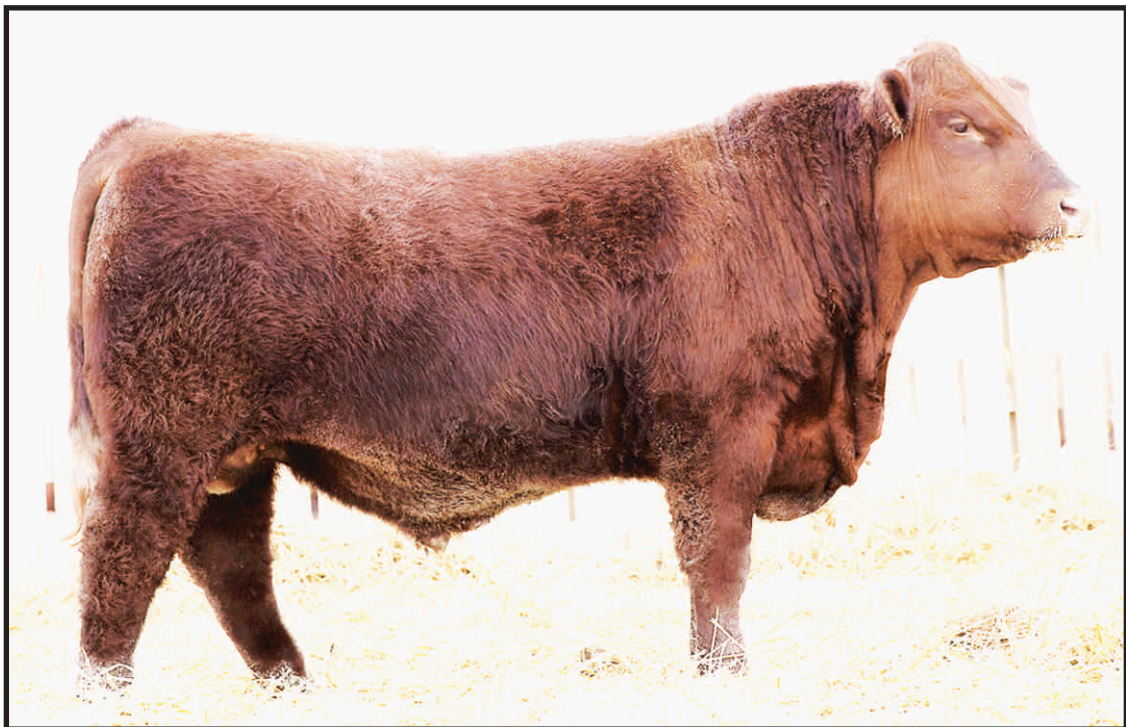
RED GOLDEN SUNSET JOHNNY H 7E - LOT 7E