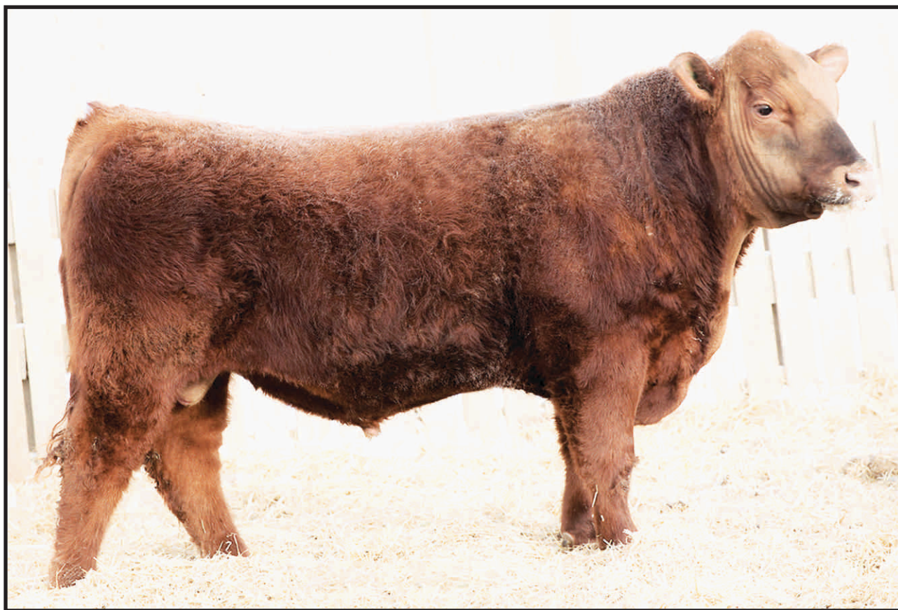
RED GOLDEN SUNSET SNIPER 17E - LOT 17E