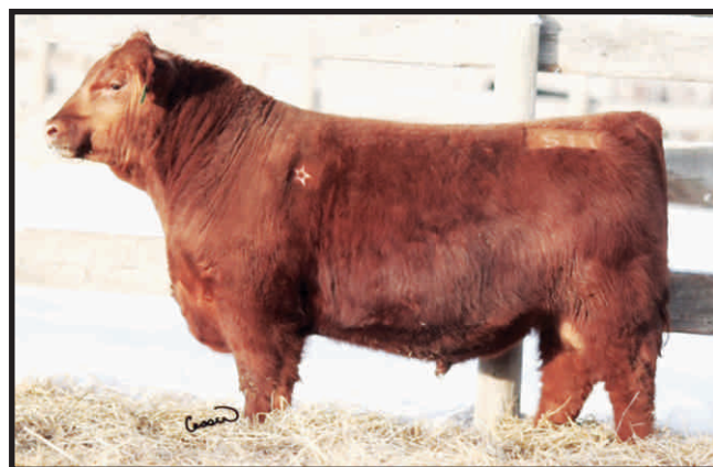
RED BCC SUPREMO GUY 11C

CROWFOOT 4232P RED OLE BRNDINA 68S RED CROWFOOT BRNDINA 4311P