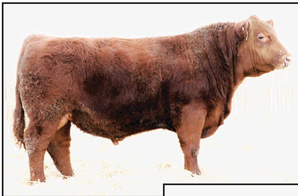
RED GOLDEN SUNSET SNIPER 53E - LOT 53E

Another calving ease giant out of our Sniper bull. EPDS in the Top 2% for BW, Top 6% for Milk and Top 8% for TM. Don't miss out as this will be our last Sniper son to sell as we lost him prior to breeding last year. Heifer Bull.