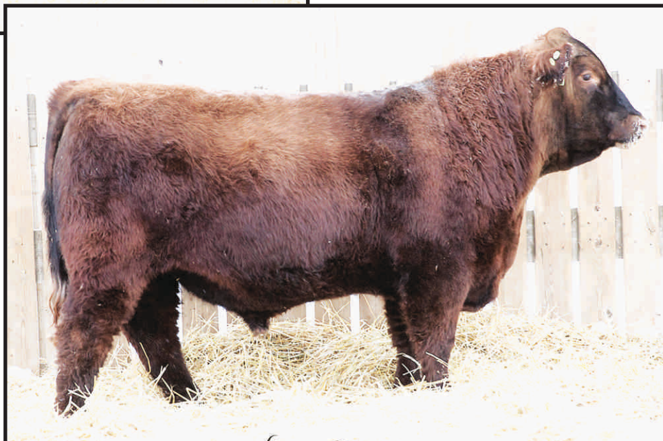
RED GOLDEN SUNSET WALL ST 62E - LOT 62E

Extremely dark red Signature calf here. His dam is our favorite cow purchase from Ole Farms. She has raised many of our high sellers in the past few years going to breeders like Bar 4A and Brewin's Angus.