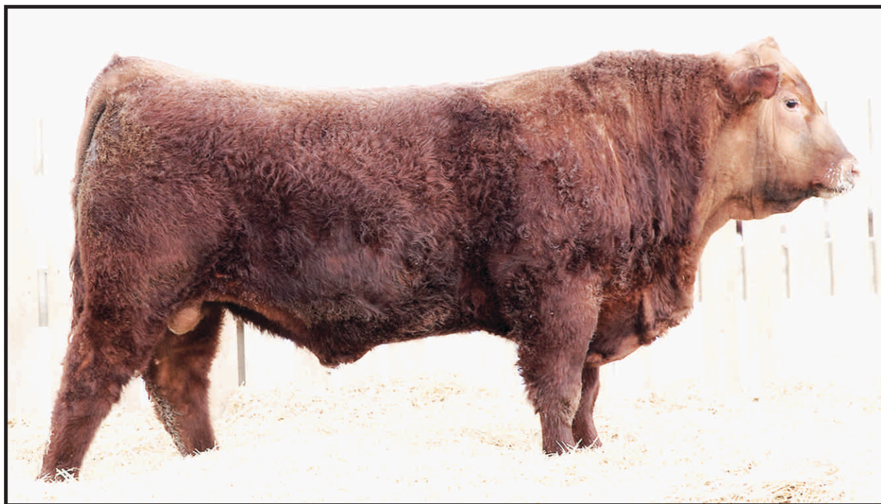
RED GOLDEN SUNSET EXCLUSIVE 5E - LOT 5E