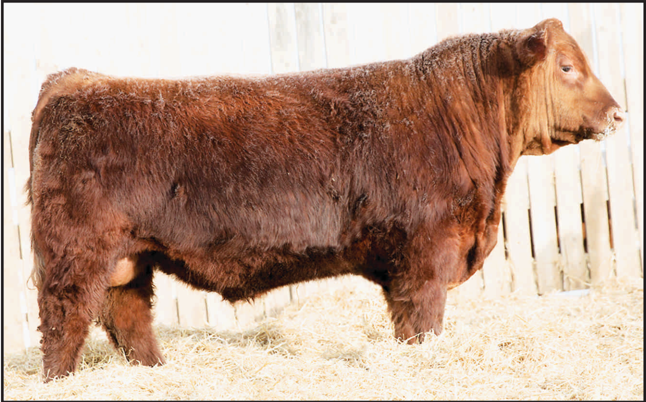
RED GOLDEN SUNSET SUPREME 24E - LOT 24E

RED CROWFOOT MOONSHINE 808IU XD CROWFOOT 0102X XD CROWFOOT BLACKBIRD 8810U D: GOLDEN SUNSET QUINCY 24C RED YY HITCH 514R RED OLE QUINCY 150W RED CROWFOOT WJ QUINCY 931J