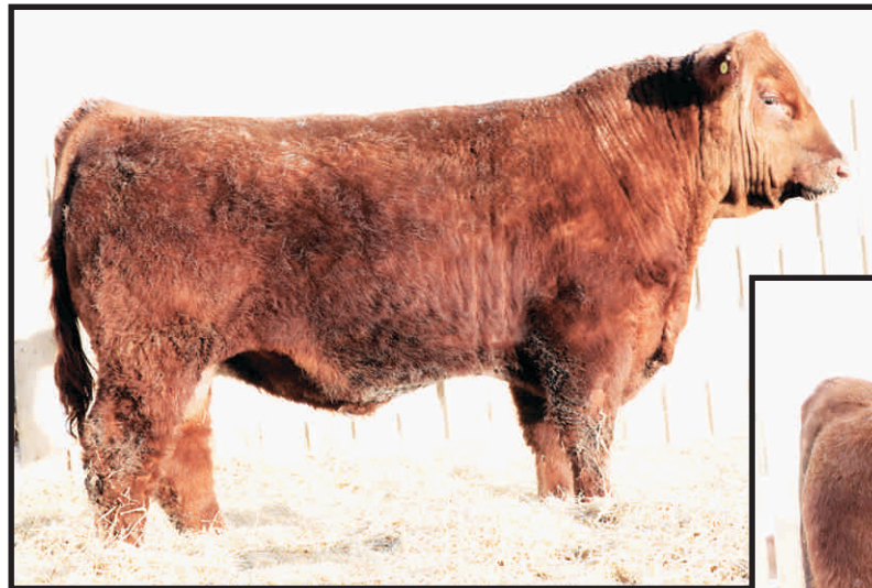
RED GOLDEN SUNSET SQ 50E - LOT 50E

This pair of twins came out of a cow we purchased at McMillan Ranching. She is a cow with as much capacity as any other cow on the farm. Add a little more BW to the equation because of the twin factor, but add a lot more performance at the end. Cows Only.