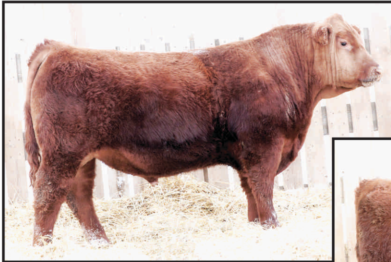
RED GOLDEN SUNSET SEQUOIA 19E - LOT 19E

The first Supremo Guy 11C son on offer out of a beautifully made Top Gun daughter. Long spined bull with lots of performance. Recommended for larger heifers or cows.