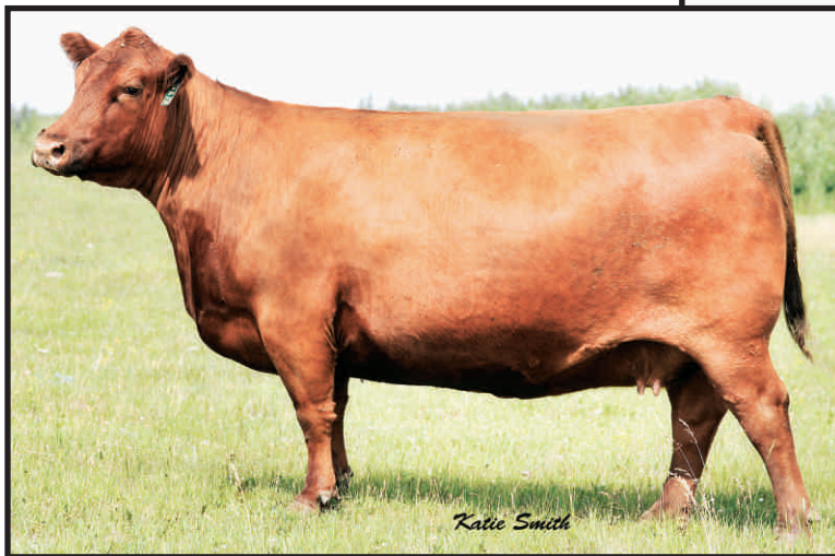
RED CROWFOOT BLACKBIRD 6125S - DAM OF LOTS 4E, 6E & 7E