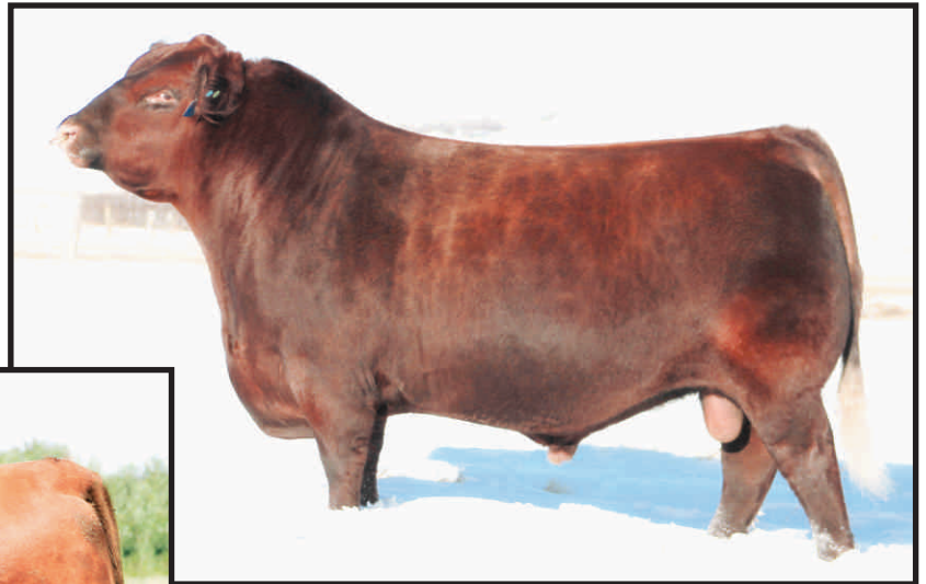
RED SIX MILE SIGNATURE 295B - SIRE OF LOTS 4E, 6E & 7E