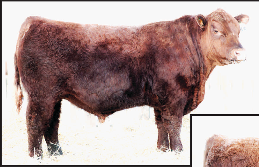
RED GOLDEN SUNSET SIGNIFIED 4E - LOT 4E