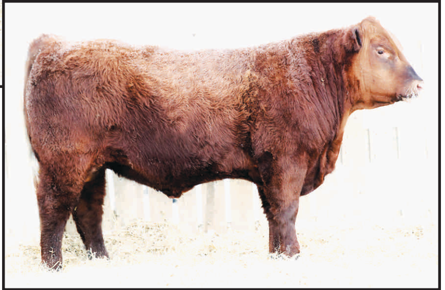
RED GOLDEN SUNSET SIGNATURE 6E - LOT 6E