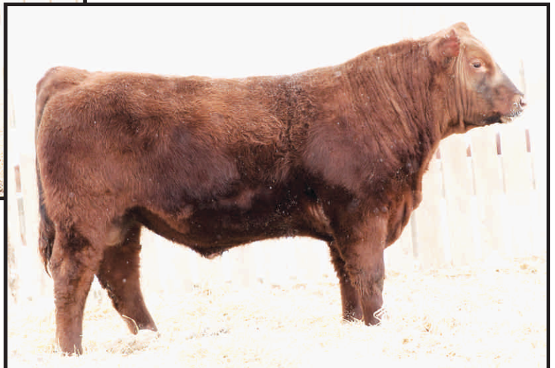
RED GOLDEN SUNSET SQ 51E - LOT 51E