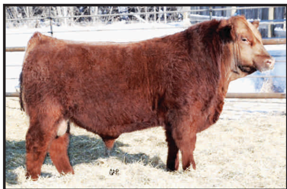
RED WHEEL MONOPOLY 85C

Supremo Guy 11C was purchased from Brandl Cattle Co. in 2016 and is out of the great Sequoia 202 herdsire. 11C has continued the calving ease tradition for us at Golden Sunset. He averages 81 lbs on BW for his bull calf progeny. A very functional and useful set of progeny on offer this year. 11 Bulls sell.