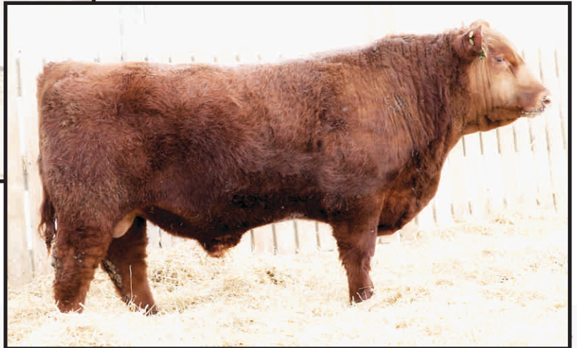
RED GOLDEN SUNSET MONOPOLY 23E - LOT 23E

Ranked in the Top 6% for WW and 7% for YW. Great muscle definition and will definitely put the pounds and performance to your calf crop. Cow bull.