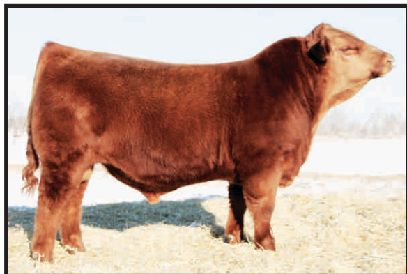
RED BAR-E-L APOLLO 144C