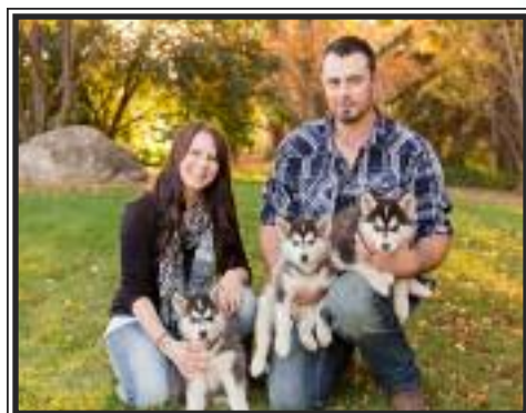
Gra Tan Farms