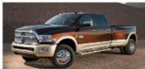
Ram 3500 HD Dually

Low, Low, Fleet Prices on Ram 2500 & Ram 3500 Heavy Duty Trucks!