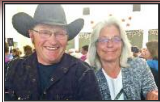
Gra Tan Farms