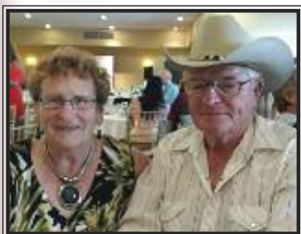
Kin Kin Cattle Co.