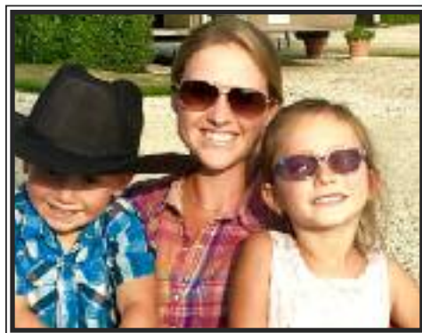
Gra Tan Farms