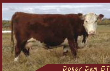
Donor Dam 5T