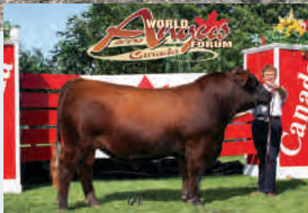
RED SMW SMACK 31U - SIRE OF LOT 143

This is one sweet made little lady! The eye appeal here is second to none! She is very structurally correct. Marta 42Y should probably be wearing a halter for some enthusiastic young individual. She would certainly look the part! Her Mulberry dam has that same great eye appeal, nice big spring of rib and very structurally correct as well. Her Grandam is designated CAA elite dam. Her sire Smack has done a great job of moderating birth weight while maintaining good growth and structural correctness. Smack made the trip to Calgary to compete in the Forum and got along pretty well too! Marta 42Y is the right kind to add to the herd. She will be easy doing and has a very maternal background.