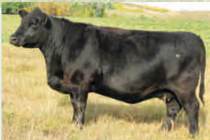
MINBURN MAY 112M - DAM OF LOTS 108 & 135