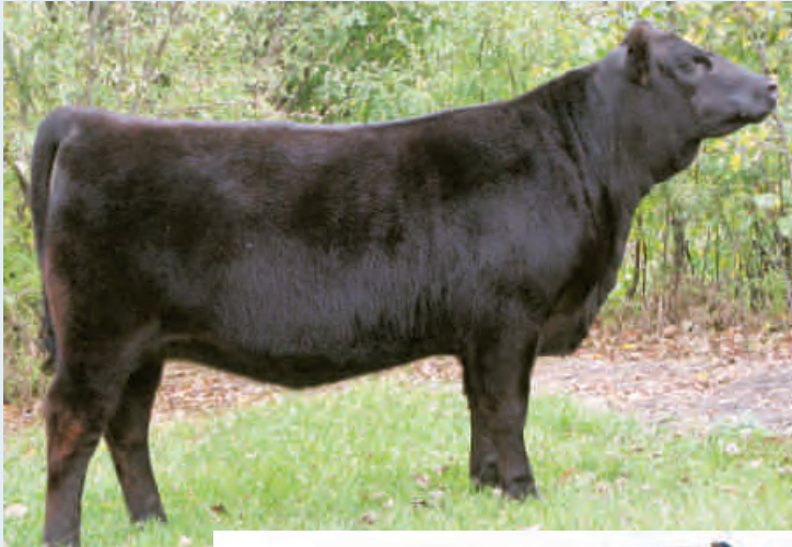
NORTHERN VIEW JESTRESS 74Y LOT 138