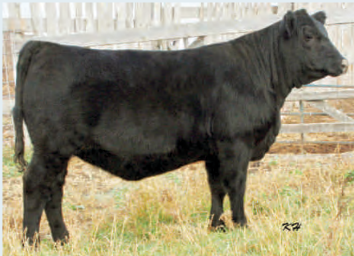
TRIPLE L J&S FOREVER LADY 301Y - LOT 131