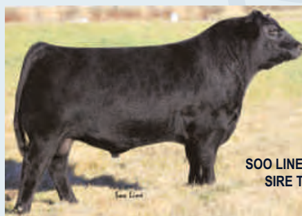
SOO LINE MOTIVE 9016 SIRE TO LOT 141