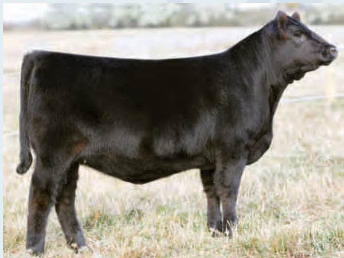
SOO LINE FAVORITE 1151 - LOT 141

SANDY BAR ADVANTAGE 43M HF KODIAK 5R AMF CAF NHF MAF WILBAR RUBY 955N S: SOO LINE MOTIVE 9016 RR 7407 RAINMAKER 2154 TLA BEAUTY 5R TERRLENE BEAUTY 35F