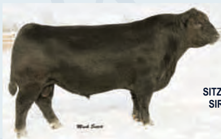
SITZ UPWARD 307R SIRE OF LOT 140

SOO LINE CATTLE CO. - ROGER HARDY (306) 458-7521