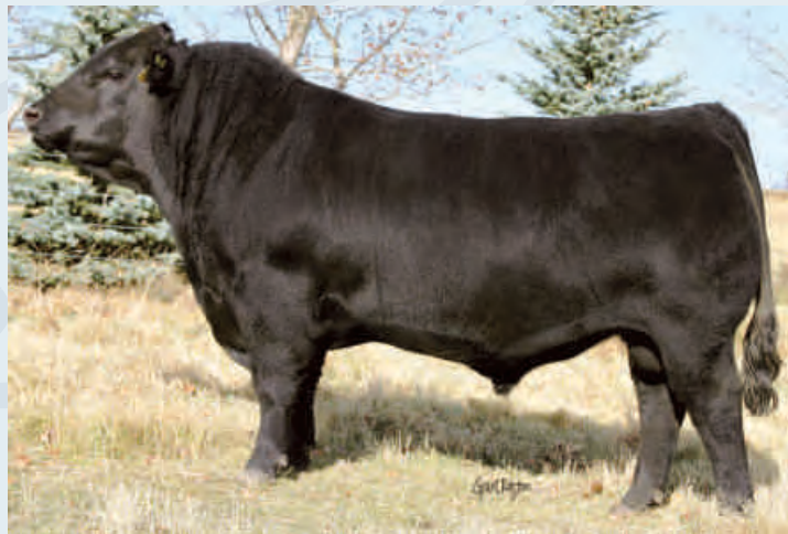
HF TIGER 5T - SIRE OF LOTS 129,131&132 EMBRYOS

TEHAMA BANDO 155 AMF CAF NHF BON VIEW BANDO 598 AMF CAC BON VIEW DORA 56 S: S A F 598 BANDO 5175 AMF CAC V D A R NEW TREND 315 AMF CAF NHF S A F ROYAL LASS 1002 S A F ROYAL LASS 6089 EMULATION N BAR 5522 N BAR EMULATION EXT AMF CAF NHF N BAR PRIMROSE 2424 D: S A V BESSIE HEIRESS 8067 G A R SLEEP EASY 1009 AMF CAF NHF S A V BESSIE HEIRESS 6091 S A V BESSIE HEIRESS 3097