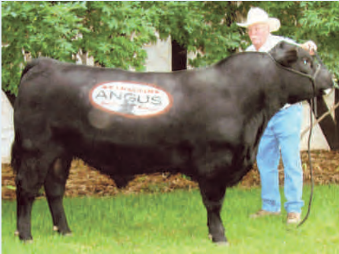
KBJ DYNASTY 330U - SIRE OF LOT 137

KBJ ROUND FARMS - JIM ROUND & FAMILY (780) 348-5638