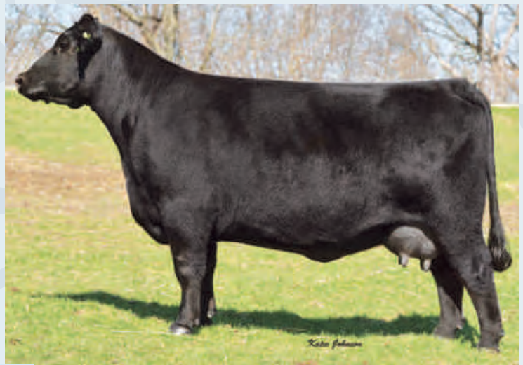
JL EVENING TINGE 7001