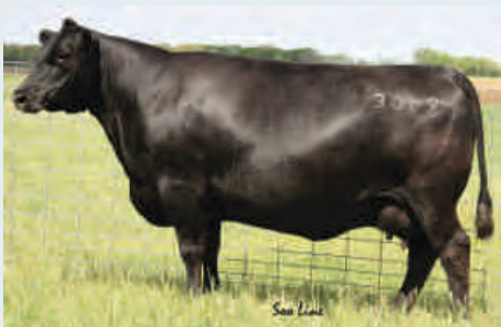
ANGUS GLEN FAVORITE 9N - DAM OF LOT 141

Soo Line Favorite 1151 is an absolute treasure. She is big bodied, soft made and shows perfect teat placement. She combines a great pedigree tabulation of Soo Line's Finest, Soo Line Motive 9016 and Angus Glen Favorite 9N. Soo Line Favorite 1151 is one of the first daughters of Soo Line Motive 9016 to sell. Motive 9016 is causing a mass of attention in his first calf crop by breeders from across the continent. Soo Line Motive 9016's dam just sold for $45,000 to ZWT from Tennessee who also bought the dam to this featured female. Angus Glen Favorite 9N recently sold for $15,000 to ZWT and is also the dam to the 2008 RBC Supreme Champion Bull Soo Line Yellowstone 6344. Favorite also has progeny at Remitall Farms, LLB Angus, Dakitch Angus and South View Ranch. Favorite 1151 has a bright future ahead of her and you wouldn't expect anything less from a female so richly bred.