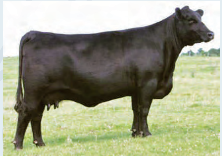
HF EVENING TINGE 57R - LOT 133