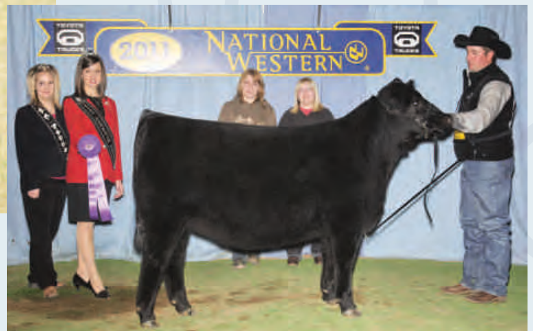
GF EVENING TINGE 1X