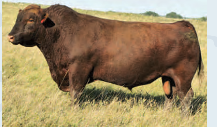
RED SOO LINE NEW TREND 8218 - SIRE OF LOT 136