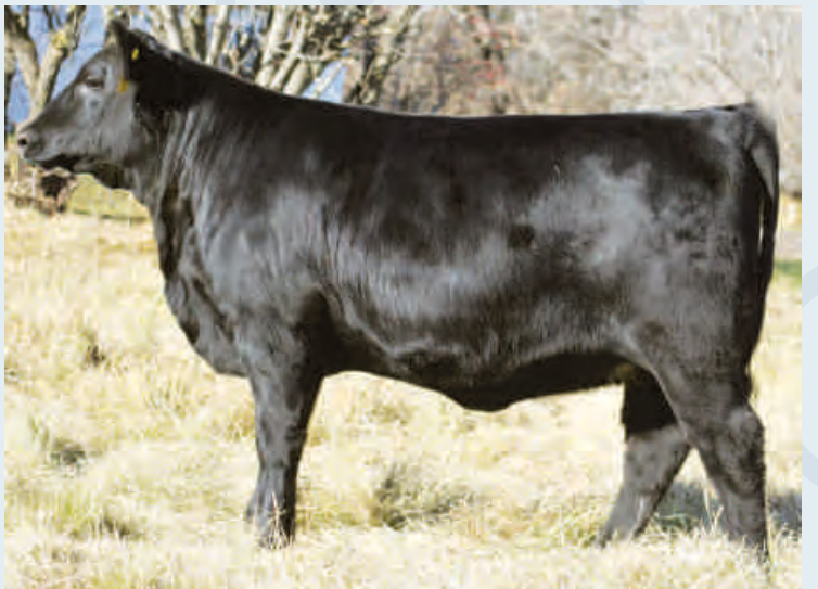
KBJ QUEEN MOTHER 72Y - LOT 136

KBJ Queen Mother 72Y comes from our Dynasty 330U bull, that was the fortunate bull to be represented at the 2009 WAF with a logo on him. Now that his spotlight was over, we put him to real use in our pastures and he has not disappointed us. He is out of one of our best females at the farm, KBJ Classy Lady 169S. 72Y is a fancy fronted female with loads of capacity and is made correct.