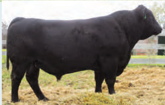
TGA BLACKMAN 8311U - SIRE OF LOT 139

NORTHERN VIEW ANGUS - TROY & AMY FRICK, ALVIN & MARLENE FRICK (306) 728-3515