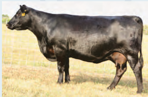
S A V BESSIE HEIRESS 0214 - DAM OF LOT 132 EMBRYOS

SAV Bessie Heiress 0214 is powerful, wide, deep and as long as any brood cow in the Angus breed. Bessie 0214 is a can't miss cow. This cow family will enhance maternal strength and performance in any herd. She comes from the same cow family that produced SAV Heavy Hitter 6347. With only one of her daughter's to every leave the farm (selling to Hamilton Farms in the 2008 Masterpiece Sale). Here is an opportunity to get in on the ground floor with genetics that will excel in the show ring and most important, in the sale ring!