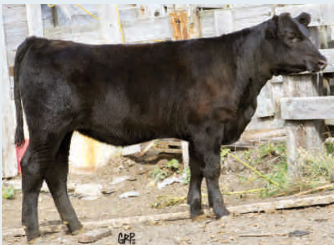
SFL MISS BURGESS 40Y - LOT 140

CONNEALY LEAD ON AMF CAF NHF CONNEALY ONWARD AMF CAF NHF ALTUNE OF CONANGA 6104 S: SITZ UPWARD 307R AMF CAF NHF SITZ VALUE 7097 AMF CAF NHF SITZ HENRIETTA PRIDE 81M SITZ HENRIETTA PRIDE 1370