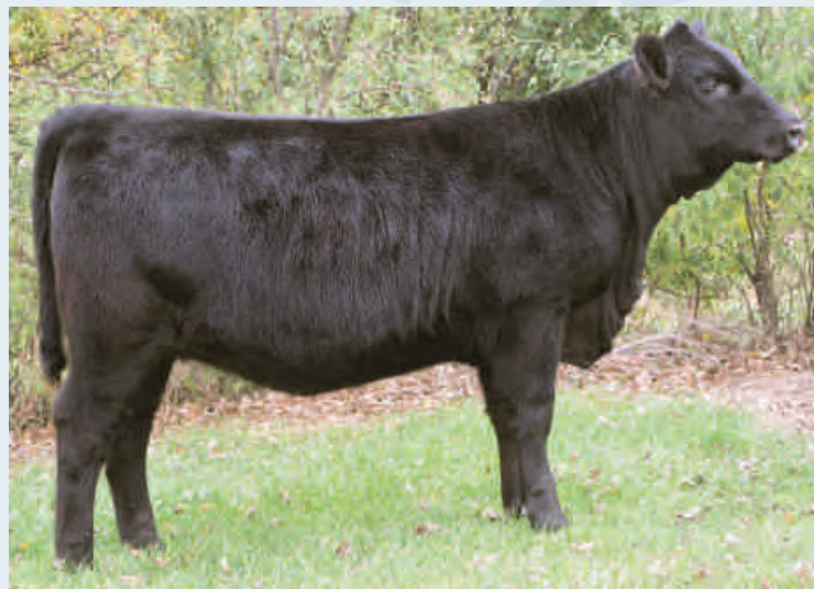
NORTHERN VIEW PRIDE 8Y LOT 139

"Jessie" as we call her has had that effortless profile show appeal from birth. Deep, even bodied with that heads up presence. She has a pedigree packed full of genetic power which has fantastic performance, super maternal instincts, impressive style and high functionality. 74Y had a maternal brother in this spring's Blue Collar Bull Sale sell to the PFRA. He is a fantastic bull, smooth, angular with power. His picture is below. Jestress 71T has produced well with her first three calves. She has a good tight udder. These 70M daughters have been very good producers in our herd. Their calves carry the style and performance of their show sire, Elixir 70M. BC Matrix 4132 was a sire we had used two years ago and really like the style, shape, performance and structure of his calves. His performance numbers are huge at weaning and yearling weights but have that unique combination of calving ease. We went back to him last year for these reasons and to provide different genetics to many of the current trends in the breed. I am confident that this female will make an eye appealing functional cow you will want in your front pasture. If you examine her pedigree and performance data you will see that she would make a good heifer to invest in.