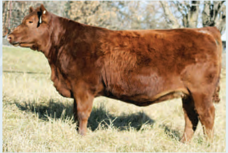
RED DREAM MAKERS SANDY 708Y - LOT 136