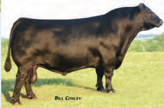
B C MATRIX 4132 - SIRE OF LOT 138

NORTHERN VIEW ANGUS - TROY & AMY FRICK, ALVIN & MARLENE FRICK (306) 728-3515