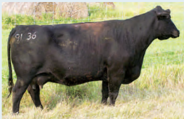
GDAR FOREVER LADY 9136 - DAM OF LOT 131

Here is the result of a Masterpiece Graduate. We purchased these embryos from Eastondale Angus and this calf is the result of 2 of the leading Angus Animals in our Country. GDAR Forever Lady 9136 sold thru this very ring to Johnson Livestock for $13,000 and before that sold to Eastondale Angus for $20,000 from Dryland Angus. She is the sire of Many breed leading animals across the land; Dryland Iceberg 231, Eastondale Break Away 32'07, Eastondale all The Way11'08, Eastondale Money Maker 23'09 and many daughters that have been retained by Eastondale & Johnson Livestock. Her sire is the Famous, HF Tiger 5T who is the $52,000 1/2 Interest Bull for Ring Creek Farms. He was the Supreme Champion in 2009 wherever he attended. A mating that has produced us 301Y, a fancy front pasture type female that will have marketability written all over her with her great background and future in the industry. J&S Cattle Co. & Triple L Livestock would like to retain a future flush at their expense and the buyer's convenience.