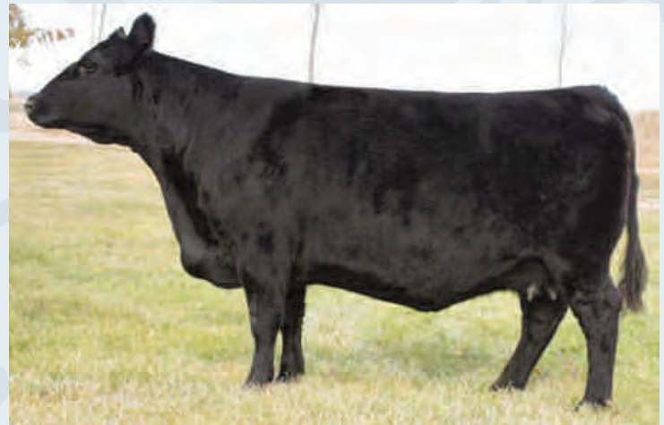
YOUNG DALE PEG 77P - LOT 145 DONOR DAM

O G L BATTLE CRY 427 128 G D A R EXECUTIVE 727AMF NHF WK GUNSMOKE GDAR SVF EXPLORER WK BONNIE 2041 G D A R FOREVER LADY 719 S: YOUNG DALE KONG 19M D: BT PEG 558J RONAN TEX 56A O S U 6T6 ULTRA PAT LADY SANDRA 2C BT PEG 147E DOUBLE J SANDRA 452Y DIXEYLANDS PEG 001