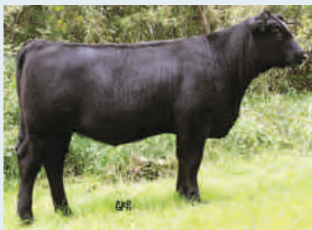
SFL MISS BURGESS 40X - MATERNAL SISTER TO LOT 140

Earley Miss Burgess 3L has done it again this year as she has another female selected for the Masterpiece Sale. Miss Burgess 40X sold in Last Year's Sale to Stewart Cattle Co. Another Maternal sister sold to Norseman Farms in a LLB Sale for $9,500 the year we bought Miss Burgess 3L. The homework has all been done here and this year's heifer is sired by Sitz Upward 307R. Upward 307R was the $85,000 top selling bull in the 2006 Sitz Bull Sale. Her figures are very hard to beat.