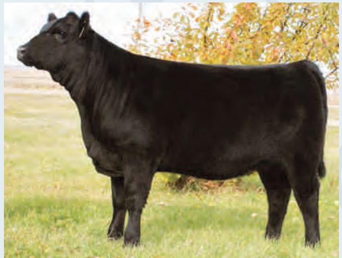
YOUNG DALE PEG 21Y - 2011 SHOW HEIFER OUT OF LOT 145

We are offering a successful flush on one of the very best Angus cows ever raised at Young Dale Angus. Her pedigree combines Beartooth Peg 558J with Pat Lady Sandra 2C. Pat Lady Sandra 2C produced more high dollar progeny for us than any other cow! Her sons, Monarch 35G, Gabriel 7L, Touchdown 36M and Kong 19M. Young Dale Kong 19M sired by WK Gunsmoke has left replica daughters of Pat Lady Sandra 2C in our herd. When you analyze the phenotype of Peg 77P, you will see she has a great front end with great neck extension and a smooth shoulder. She has great width of base followed by a big square hip, wide pin bone setting, great quarter and for a 7 year old, Wow what an udder. Peg 77P has a heifer calf at side this year by the legendary Young Dale Hogan 3Y that is sure to catch your eye this fall. Peg 77P is the kind that one could build and preserve an Angus Empire.