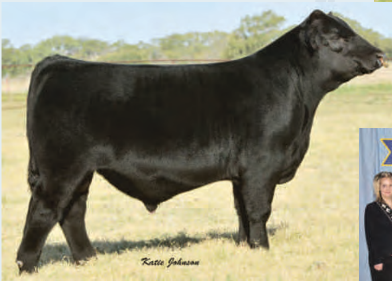
TRANSFORMER - SON OF GF EVENING TINGE 1X