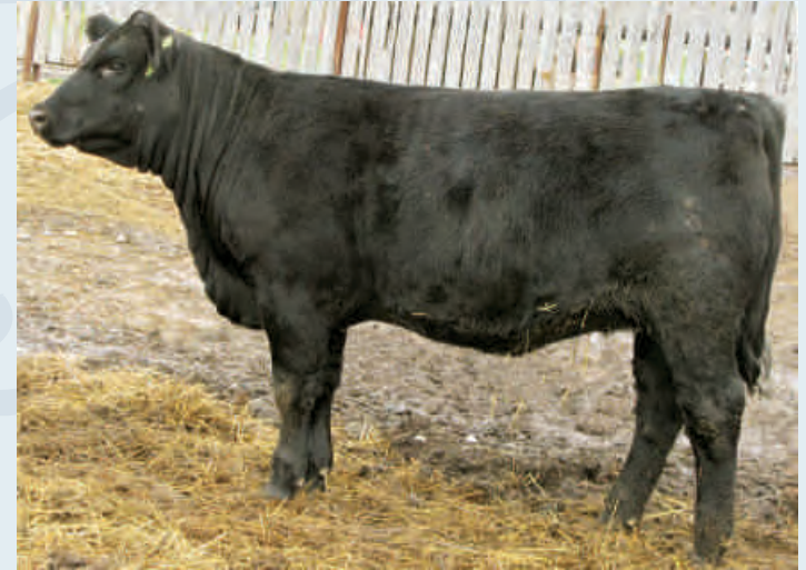
J SQUARE S ATLANTA 2Y - LOT 130

REMITALL NIGHTHAWK 37N GDAR QUANTUM 963 REMITALL H RACHIS 21R AMF NHF OSF NORTHERN VIEW QUANTUM 86P HENDERSON MISSIE 32'02 CRESCENT CREEK BLACKBIRD 21J S: MJ ESCALADE 2W AMF NHF D: J SQUARE S ATLANTA 1T W C C PRECISION E161 J239 AMF CAF NHF NORTHERN VIEW FLYING ELIXIR70M REMITALL ANNIE 543T NORTHERN VIEW ATLANTA 86R PAHL 611C ANNIE K 9R KBJ ATALANTA 583K