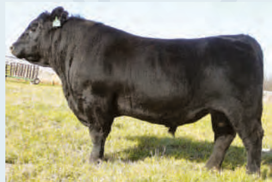
MJ ESCALADE 2W - SIRE OF LOT 130

This year has been very exciting year for us as it is the first calf crop for our new herdsire MJ Escalade 2W. Our consignment this year is a feminine daughter of Escalade himself. This heifer is a very powerful individual with a strong top, loads of length and a clean front end. Her damn has been a very consistent cow in our herd. A daughter of the now deceased Quantum 86P, a bull who has left an excellent set of females for Northern View Angus and Bell Angus, is a cow that produces year after year for us. The Escalade progeny have really stood out amongst this year's calves. They possess bone, hair, style, explosive growth and great maternal upside. I believe that this heifer will go on to be successful in the show ring and most importantly, become a great cow. Don't miss this opportunity to acquire the first Escalade.