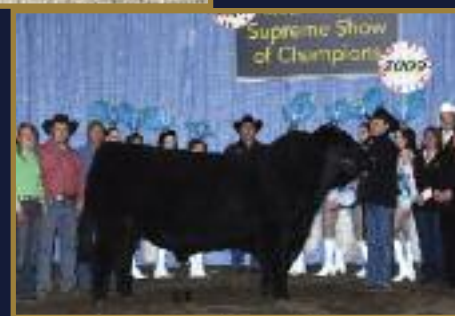
HF TIGER 5T 2009 SUPREME CHAMPION BULL, FARMFAIR INTERNATIONAL & 2009 SUPREME CHAMPION BULL, CANADIAN WESTERN AGRIBITION