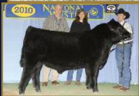
HF SWAGGER 75W - SON OF HF TIGER 5T SOLD IN THE MASTERPIECE SALE FOR $37,500.00