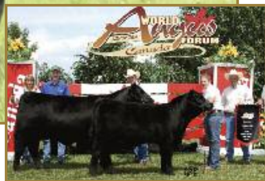
HF ERICA 26T & HF ROCK STAR 67W 2009 WORLD ANGUS FORUM CHAMPION 2 YEAR OLD FEMALE