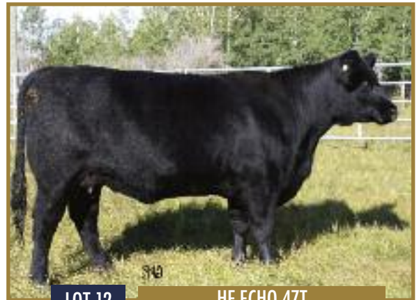
LOT 12 HF ECHO 47T

AI APR 10 SOUTHLAND EXCLUSIVE 62U CHECKED SAFE. PE HF HEMI 151T MAY 8 - JUNE 19