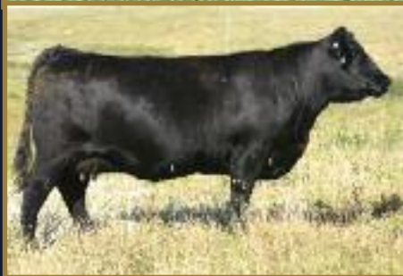
WILBAR RUBY 955N - DAM OF HF KODIAK 5R

Note his impressive EPD's for birth, performance and milk! Cows bred to Kodiak typically calve 5 to 10 days early, have low birth weights and wean heavy. His daughters have awesome udders with tight attachment, small teats, and longevity to burn. There is a reason Kodiak is so popular today...he breeds true and he is the cow mans kind.