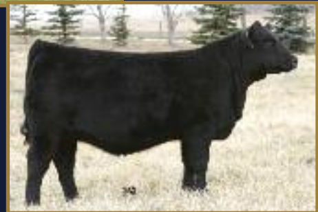
HF BLACKBIRD 63X - DAUGHTER OF HF KODIAK 5R SHE SELLS AS LOT 20