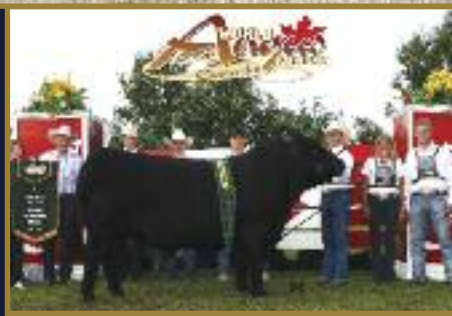
HF TIGER 5T 2009 WORLD ANGUS FORUM GRAND CHAMPION BULL