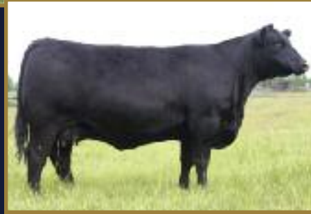
HF ERICA 26T - DAUGHTER OF HF KODIAK 5R HIGH SELLING HEIFER CALF IN THE 2007 HAMILTON SALE SHE SELLS AS LOT 1