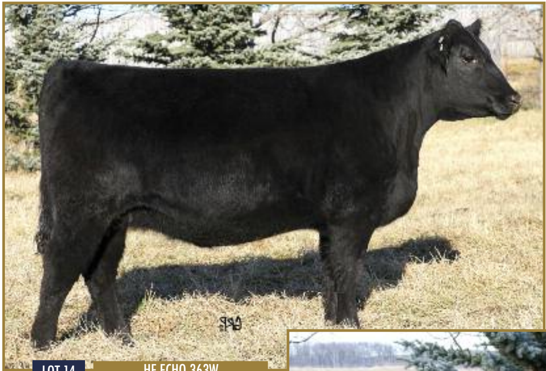
LOT 14 HF ECHO 363W

AI APR 9 TO HF KODIAK 5R CHECKED SAFE. PE SIX MILE FINAL ROUND 914W MAY 18 - JULY 27