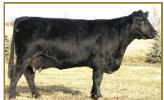
REF HF ECHO 90J • DAM OF LOT 13