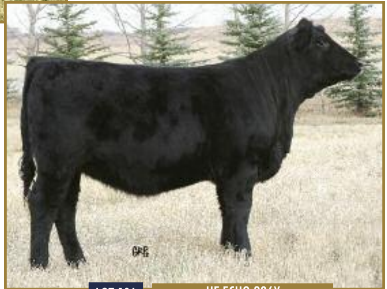
LOT 10A HF ECHO 296X