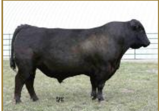
REF SANDY BAR IDEAL • SIRE OF LOTS 14 & 15