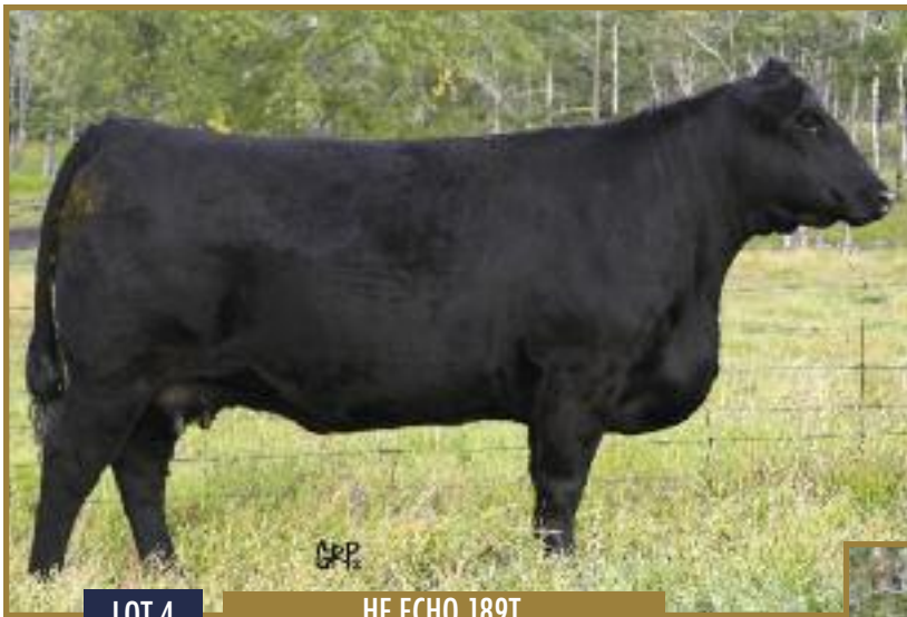
LOT 4 HF ECHO 189T

AI APR 17 TO HF HEMI 176W CHECKED SAFE. PE HF HEMI 151T MAY 8 - JUNE 19