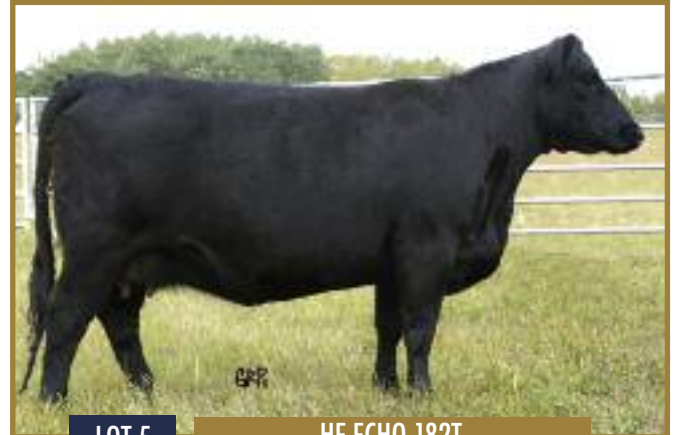
LOT 5 HF ECHO 182T

AI MAY 14 TO HF SWAGGER 75W CHECKED SAFE. PE HF HEMI 151T MAY 30 - JUNE 19