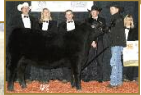
HF ERICA 20X THE LEGENDS OF THE FALL CHAMPION HEIFER AT FARMFAIR INTERNATIONAL 2010

20X is a broody young matron will make your jaw drop when you see the power, volume, and overall thickness she possesses. She is already a winner in the show ring, winning Supreme Champion Heifer in the Legends of the Fall Show at Farmfair International 2010.