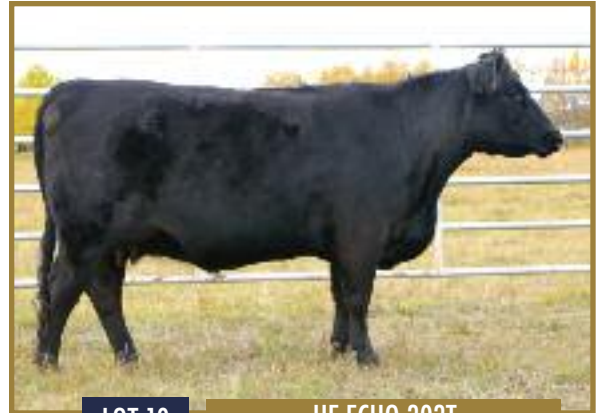
LOT 10 HF ECHO 303T