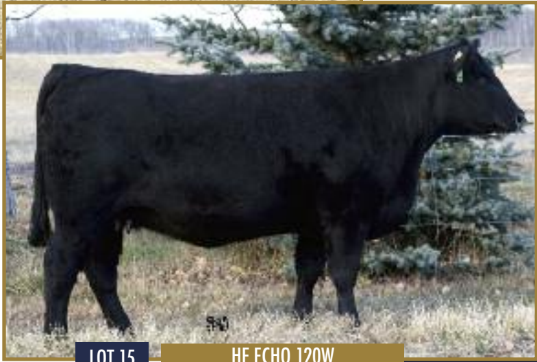
LOT 15 HF ECHO 120W