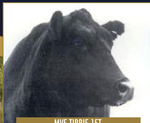
MVF TIBBIE 15T

"A very reputable cattle breeder from Scotland commented on the "Power" in Tibbie's head and said it would certainly be a reflection in how well she would breed in the years to come"