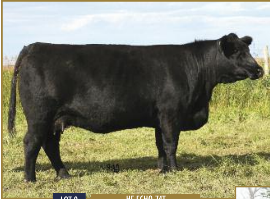
LOT 9 HF ECHO 74T