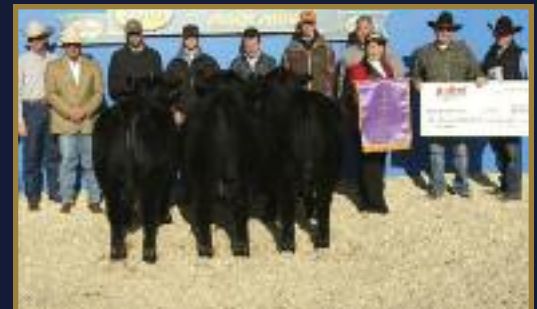
GRAND CHAMPION PEN OF BULLS AT THE 2010 NATIONAL WESTERN STOCK SHOW, DENVER, CO WAS Sired BY HF KODIAK 5R