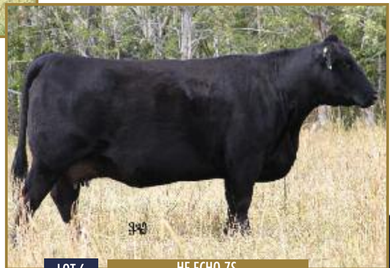
LOT 6 HF ECHO 7S

AI APR 7 TO HF EL TIGRE 28U CHECKED SAFE. PE HF KODIAK 250U MAY 29 - JULY 19