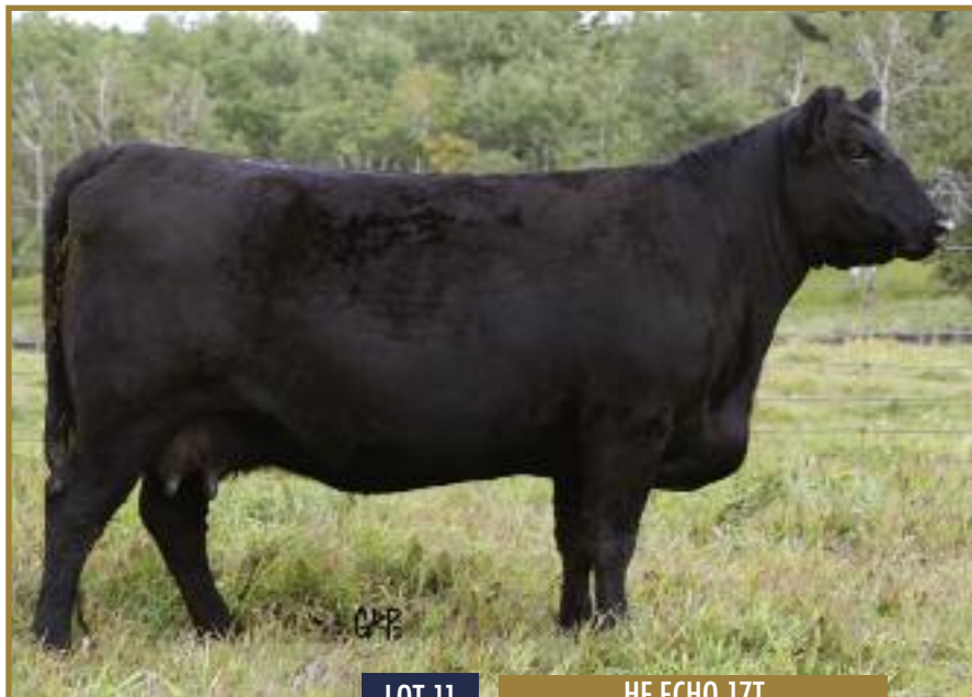
LOT 11 HF ECHO 17T

OBSERVED BRED MAY 4 HF KODIAK 250U CHECKED SAFE. PE HF HEMI 151T MAY 25 - JULY 19