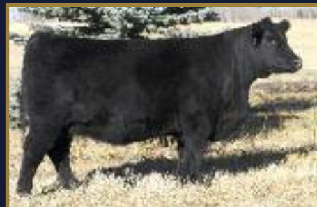
HF EVENING TINGE 138W - DAUGHTER OF HF TIGER SHE SELLS AS LOT 64